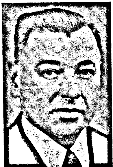
MAYOR JOHN KAPSCH To Open Baseball Season Here.

Universal Postal Union All countries now belong to the Universal Postal Union.